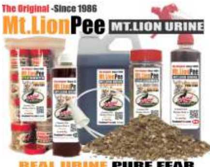
EAL URINE PURE FEAR

PredatorPee®100% Mt. Lion Urine creates the realistic impression that Mt.