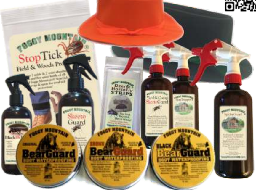
Free Shipping on All Orders to USA & Canada